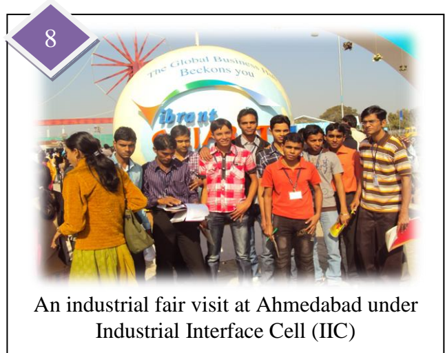
An industrial fair visit at Ahmedabad under Industrial Interface Cell (IIC)