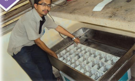
A state govt. project of soil testing to issue soil health cards by Chemistry students