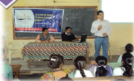
A special programme of Proficiency in English under SCOPE