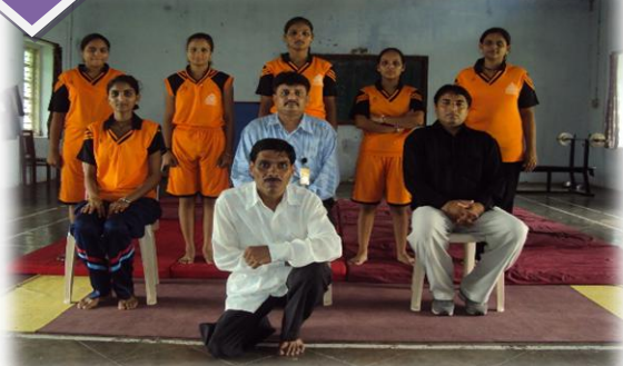
Gujarat University south zone power lifting women champion team