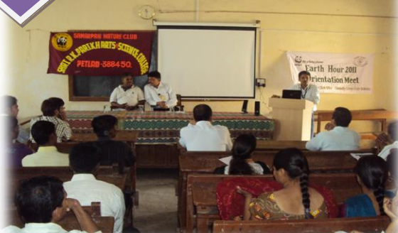
A special lecture to support largest environmental event – “Earth Hour”