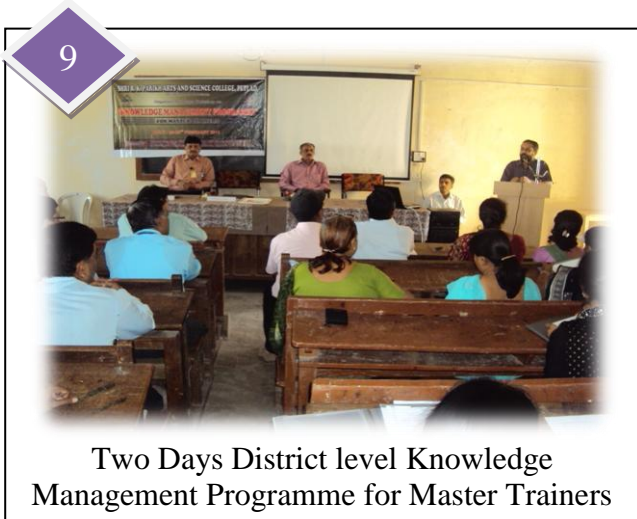
Two Days District level Knowledge Management Programme for Master Trainers