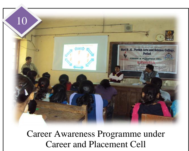
Career Awareness Programme under Career and Placement Cell