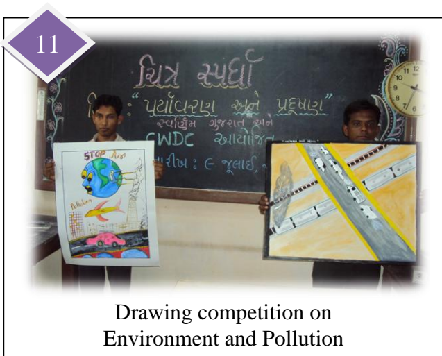
Drawing competition on Environment and Pollution