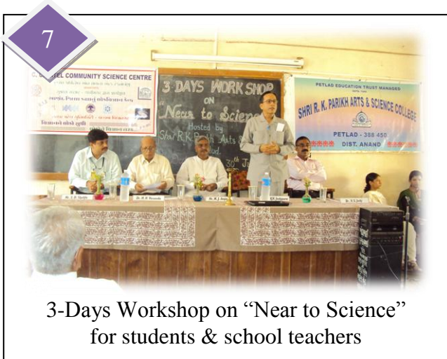
3-Days Workshop on “Near to Science” for students & school teachers