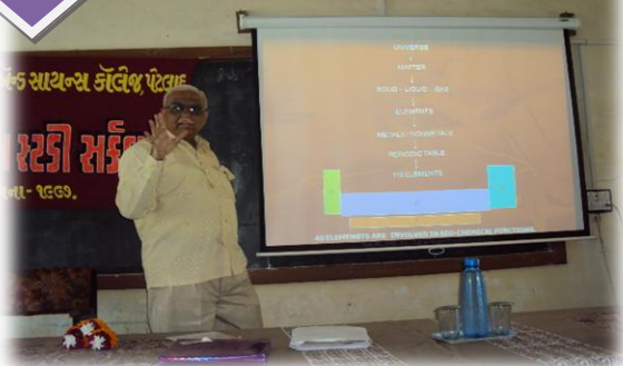
One Day Seminar for Chemistry Students under Science Study Circle