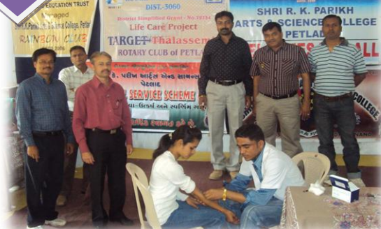
Thalassemia Checkup camp with the help of Rotary Club of Petlad